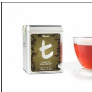
t-Series Mango and Strawberry