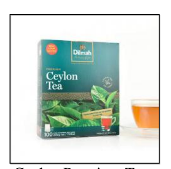
Ceylon Premium Tea