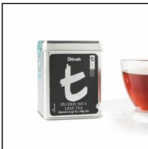
t-Series Pu-erh No. 1 Leaf Tea