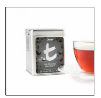
t-Series The Original Earl Grey