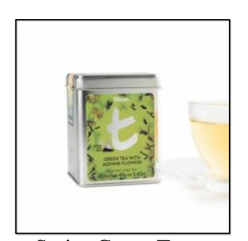
t-Series Green Tea with Jasmine Flowers