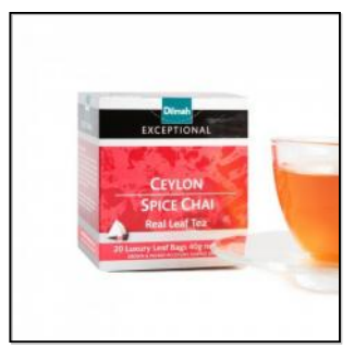
Exceptional Ceylon Spice Chai