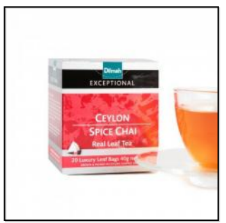
Exceptional Ceylon Spice Chai