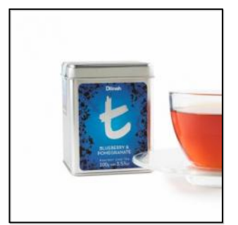
t-Series Blueberry & Pomegranate