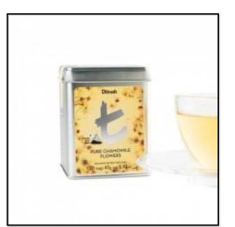
t-Series Pure Chamomile Flowers