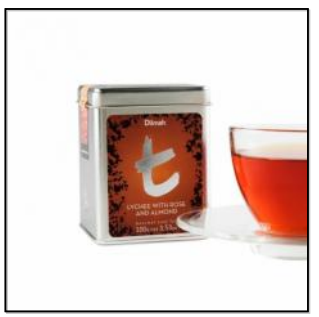
t-Series Lychee with Rose & Almond