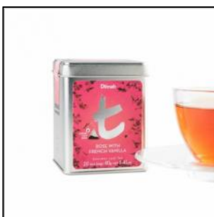
t-Series Rose With French Vanilla