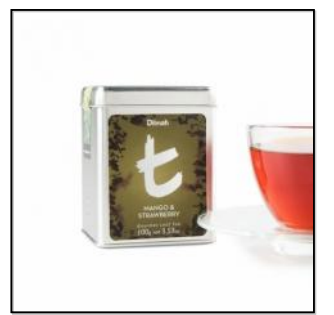
t-Series Mango and Strawberry