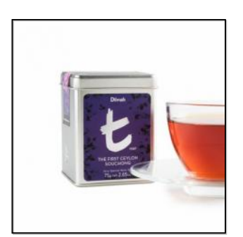
t-Series The First Ceylon Souchong