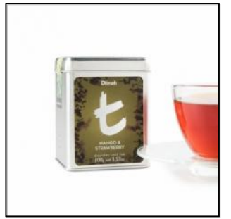
t-Series Mango and Strawberry