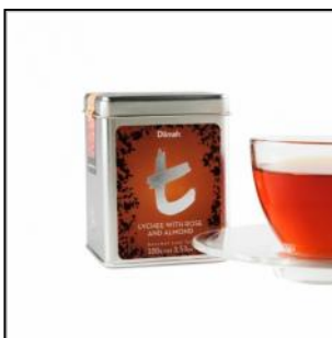
t-Series Lychee with Rose & Almond