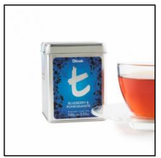
t-Series Blueberry & Pomegranate