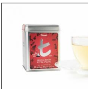
t-Series Sencha Green Extra Special