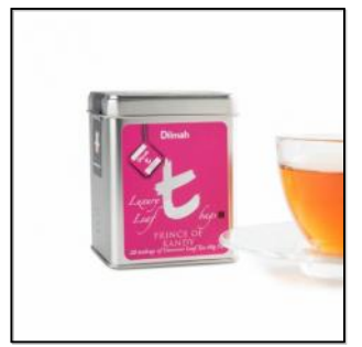
t-Series Prince of Kandy