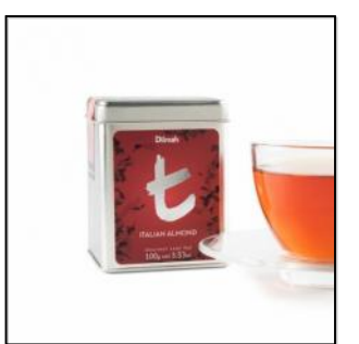
t-Series Italian Almond Tea