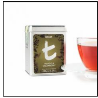
t-Series Mango and Strawberry