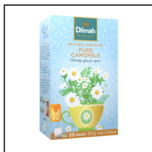
Natural Infusion Pure Camomile