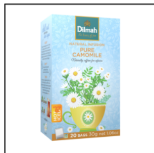
Natural Infusion Pure Camomile