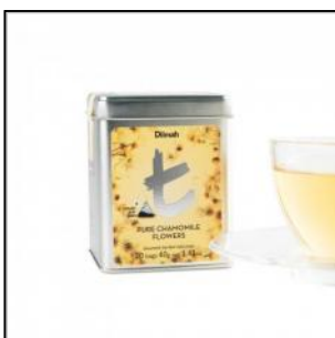
t-Series Pure Chamomile Flowers