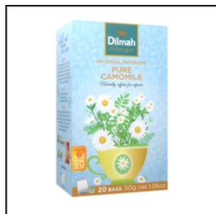
Natural Infusion Pure Camomile