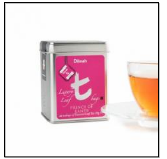
t-Series Prince of Kandy