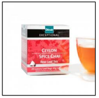
Exceptional Ceylon Spice Chai