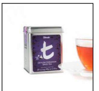
t-Series Ceylon Cinnamon Spice Tea