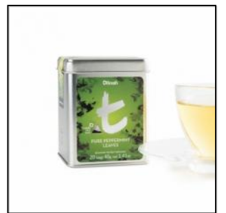
t-Series Pure Peppermint Leaves