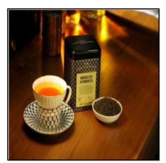
Silver Jubilee Nuwara Eliya Afternoon Tea