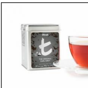
t-Series The Original Earl Grey