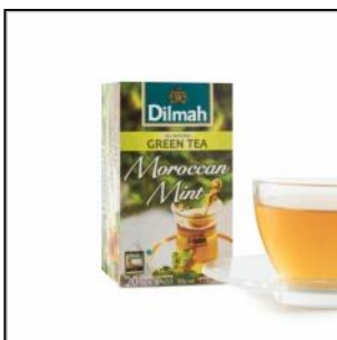
Moroccan Mint Green Tea