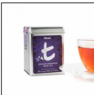
t-Series Ceylon Cinnamon Spice Tea