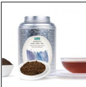
Vivid Aromatic Earl Grey Tea