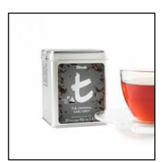
t-Series The Original Earl Grey