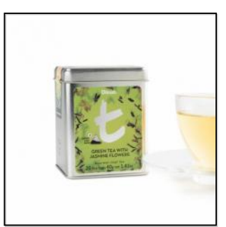
t-Series Green Tea with Jasmine Flowers