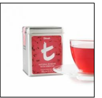
t-Series Natural Rosehip with Hibiscus

SMOKY ROSE SMOKED DUCK | FOIE GRAS GEL INFUSED WITH ROSE AND FRENCH