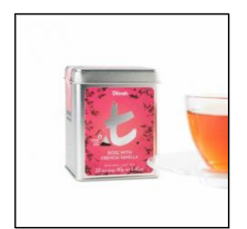
t-Series Rose With French Vanilla