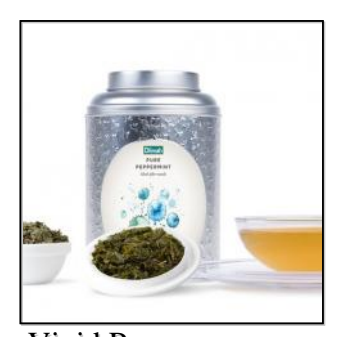
Vivid Pure Peppermint