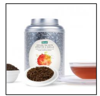
Vivid Ceylon Tea with Apple Pie & Vanilla