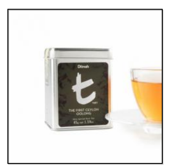
t-Series The First Ceylon Oolong