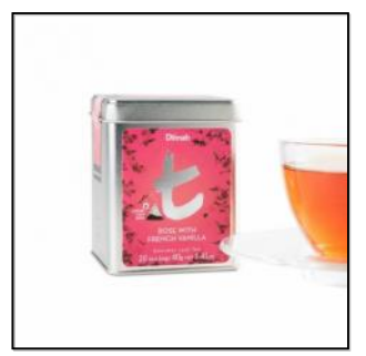
t-Series Rose With French Vanilla