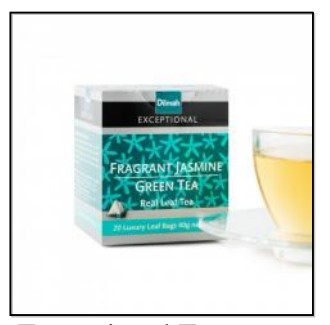
Exceptional Fragrant Jasmine Green tea