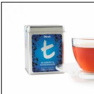
t-Series Blueberry & Pomegranate