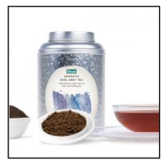
Vivid Aromatic Earl Grey Tea