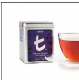
t-Series The First Ceylon Souchong