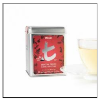
t-Series Sencha Green Extra Special