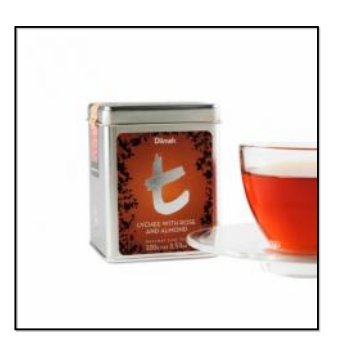
t-Series Lychee with Rose & Almond