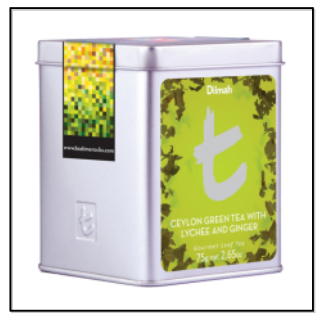
t-Series Ceylon Green Tea with Lychee and Ginger