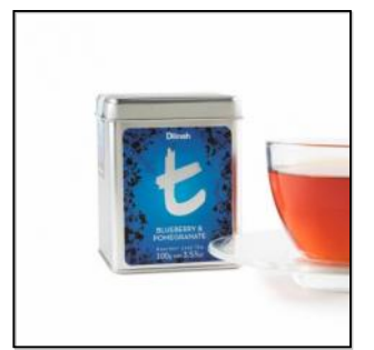
t-Series Blueberry & Pomegranate