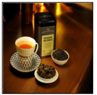
Silver Jubilee Pure Darjeeling Single Region tea