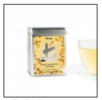
t-Series Pure Chamomile Flowers