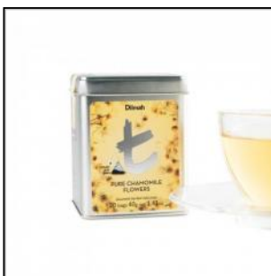
t-Series Pure Chamomile Flowers