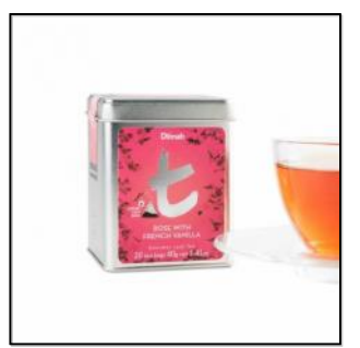
t-Series Rose With French Vanilla