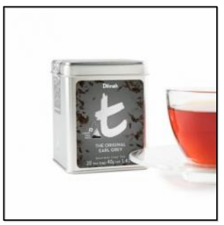
t-Series The Original Earl Grey