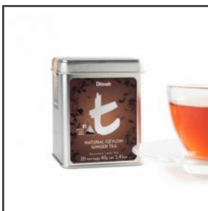
t-Series Natural Ceylon Ginger Tea