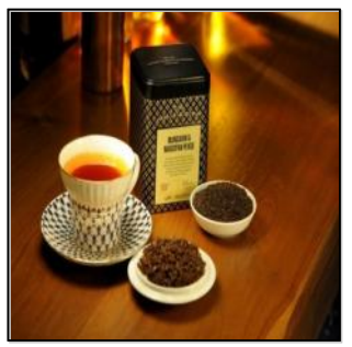
Silver Jubilee Mandarin & Marzipan Pekoe