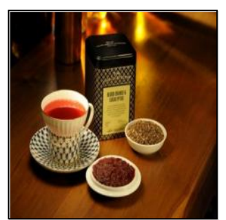
Silver Jubilee Blood Orange & Eucalyptus