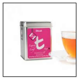
t-Series Prince of Kandy